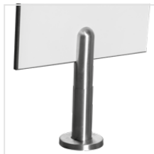
adjustable foot (stainless steel)