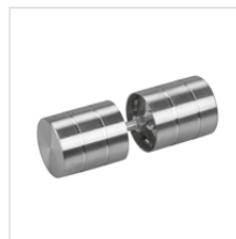
door handle for cubicle (stainless steel)