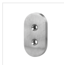
door stop (stainless steel)