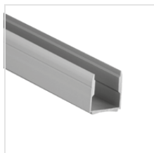
U profile for attaching panels to the wall (anodized aluminium)