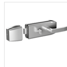
handle with lock (stainless steel)