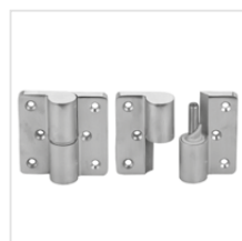
self-closing hinges (stainless steel)