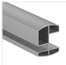
top profile (anodized aluminium)