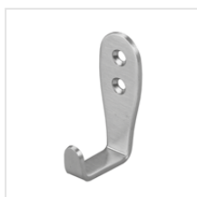
hook (stainless steel)