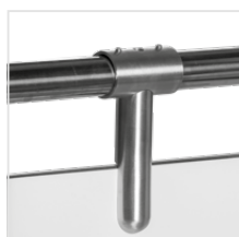
upper tubular profile, diameter 30 mm (stainless steel); for panel widths up to 60 cm, the upper profile does not need to be used